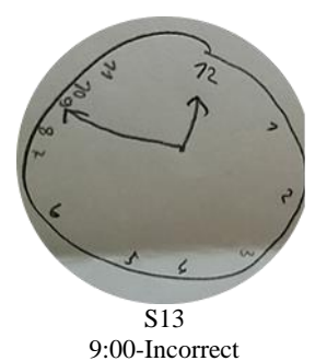
Figure 2. Samples drawings

The students were also asked to indicate the hour and minute hands on a given clock face. Their answers and frequencies are demonstrated in Tables 7 and 8. As can be inferred from Table 7, seven students indicated the hour hand correctly, eight incorrectly, and 5 left this question unanswered.