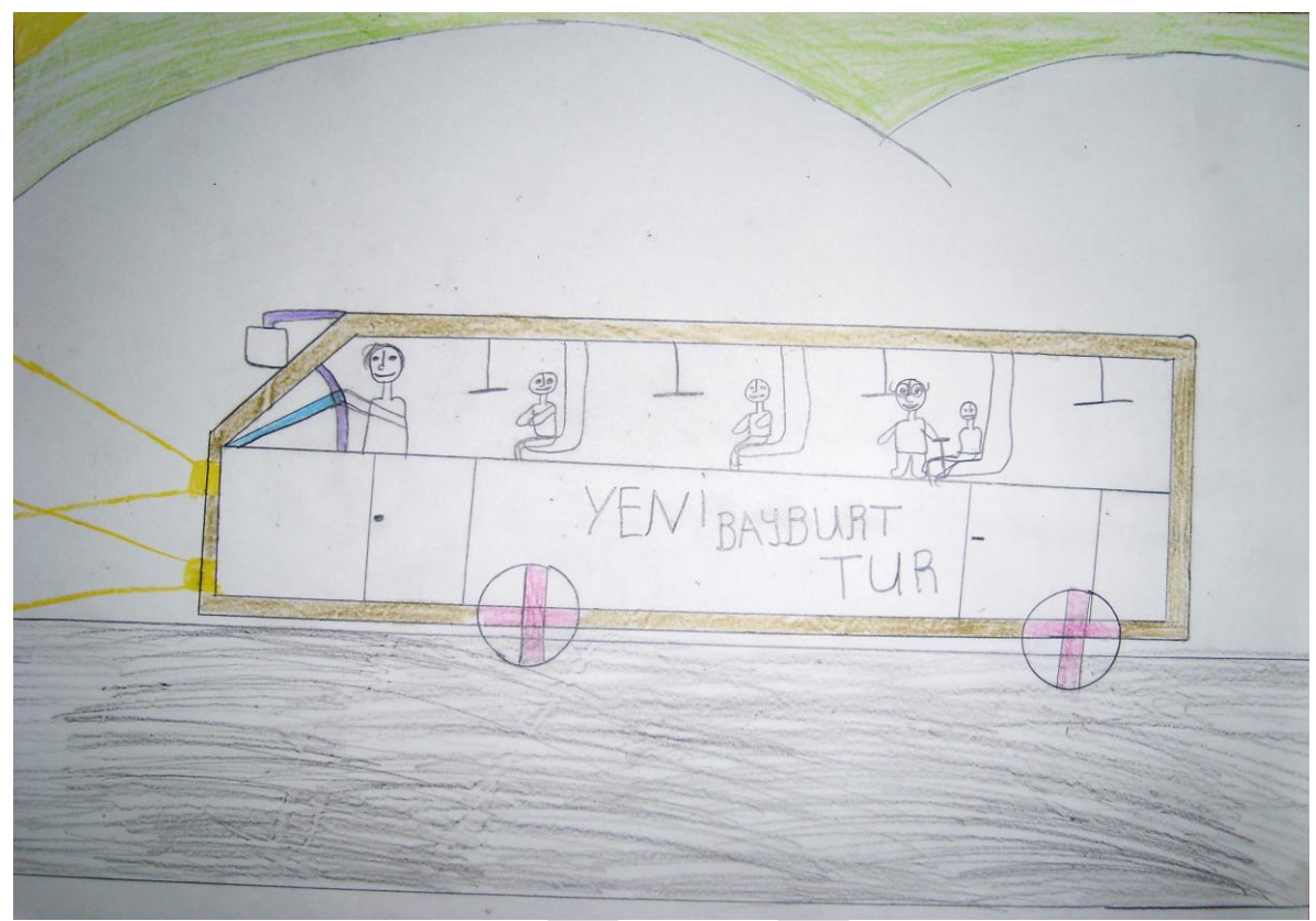
Picture2. Person helping the elderly

3) Social Responsibility Perception: When sample cases to be possessed by active citizens in terms of social responsibility which is depicted in the pictures are examined, it was determined that "the person who is respecting his flag" was drawn more in comparison to other behaviors (8 themes). In addition, it was determined that the behavior of "the person who is doing his citizenship duties" followed this behavior (7 themes).