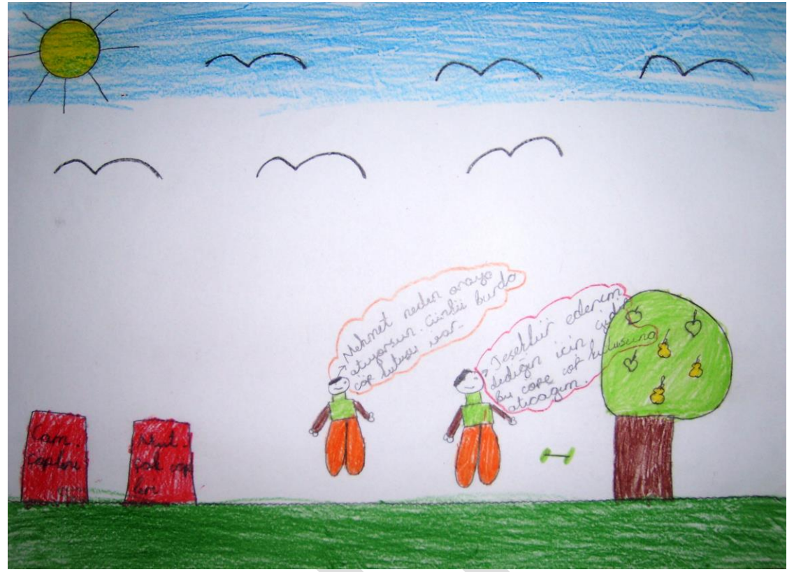
Picture1. The person, warning the individual who is throwing garbage to the floor

2) Collaboration Perception: When sample cases to be possessed by active citizens in terms of collaboration that was tackled in the drawings are studied, it was determined that "the individual who helps persons in their surroundings" was drawn more in comparison to other behaviors (12 themes, 12/110). In addition, it was seen that "person helping organizations such as associations and trusts" came after this (5 themes, 5/110).